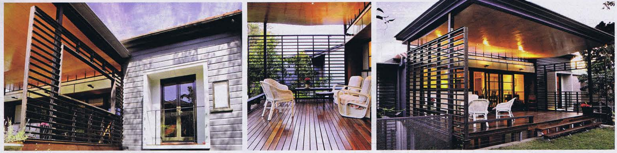
BATTEN UP ... a comprehensive renovation of this New Farm home did away with a long, inconvenient veranda to make way for a usable, stylish deck that links with the newly level back yard.

Pulling off the perfect renovation requires attention to the minutiae as well as an understanding of the big picture.